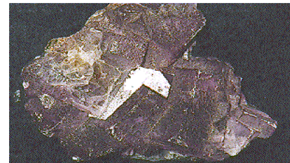
Illinois State Mineral — Fluorite